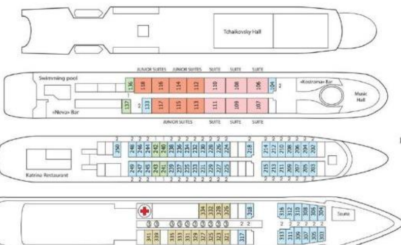
Figures on the scheme stand for number of places in a cabin. The figure in the circle is the number of places in a cabin where there is one bed above the other.