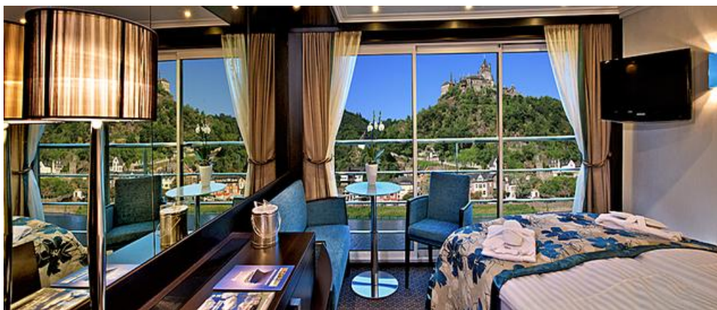
Example of upgraded cabin – Additional $2,484 per person twin share