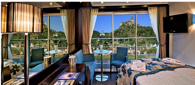
Example of upgraded cabin

Note: In the event of water level problems on stretches of any river, it may be necessary to operate part of the itinerary by motorcoach